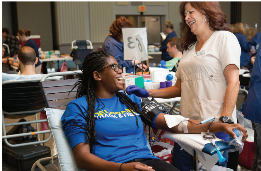
Above: The Community Engagement Scholars inaugurated their new program with a pre-semester service trip with Sussex County Habitat for Humanity in Laurel and Millsboro, Delaware. Left: In 2017, for the sixth straight year, and for the 10th time overall, the University of Delaware has captured the Colonial Athletic Association Blood Challenge title.