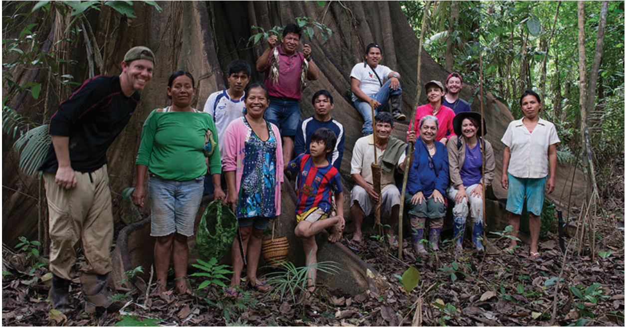
Above: A multidisciplinary team documented the culture of the Ese'Eja people, one of the last indigenous cultures of the Peruvian Amazon. Right: A Cooperative Extension Master Gardener teaches students from the Early Learning Center about growing food from seed to fruit.