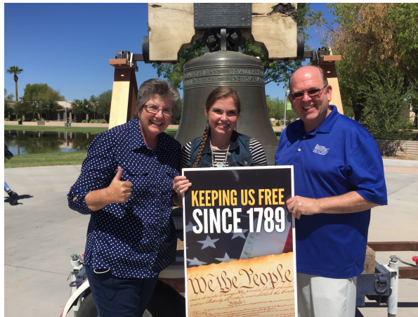
Constitution Day 2016 Arizona Liberty Bell