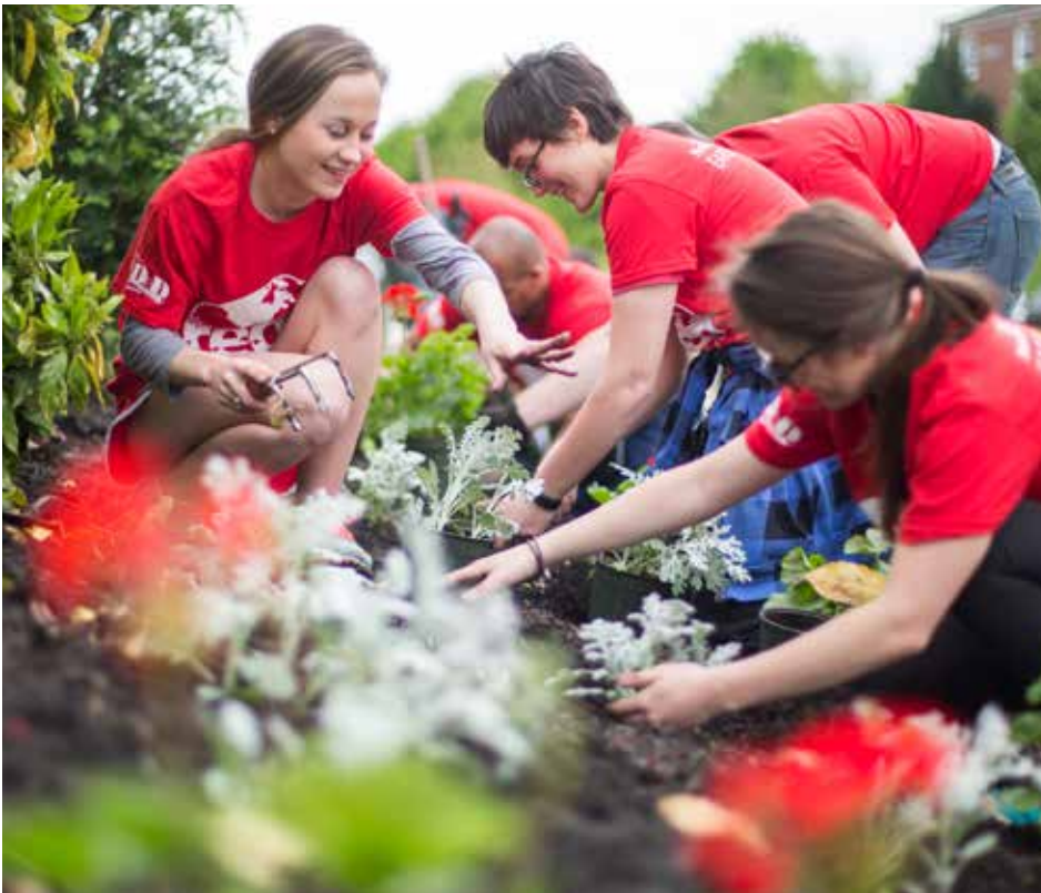
Austin Peay State University (TN)

Yet today, AASCU institutions continue to be stewards of place in a different context. Today we recognize that the country demographics have changed whereby people of color are becoming the new majority of America. Our country has also experienced a worldwide pandemic never experienced in our lifetimes, affecting the way institutions deliver education and the way we live. We have lived through an insurrection hitting the