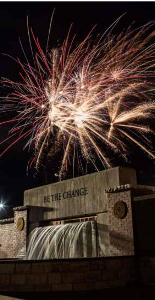
Northeastern State University (OK)

very core of our democracy; we have witnessed racist and sexist attacks on the new majority—African Americans, Latinos, LGBTQIA+, Asian Americans, and women. Gun violence has risen exponentially in our communities, and we are witnessing a country deeply polarized by party lines. And now, we are experiencing inflation, impacting the economic lives of our country's most vulnerable, the low- and middle-income populations; the very individuals AASCU institutions serve.