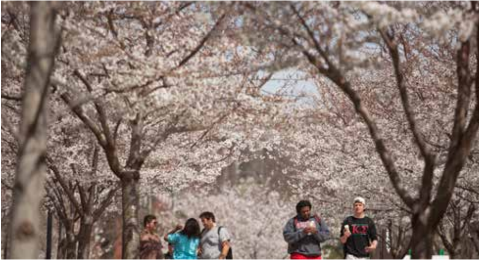
Western Kentucky University

nors, inculcating civic skills within students, and claiming and leveraging their status as public institutions in the democratic sense of the word, AASCU institutions will live into the stewardship of place mission in ways that serve democracy and strengthen local economies. College campuses can also be anchor convenors for balanced public debate or contested spaces of political conflict.